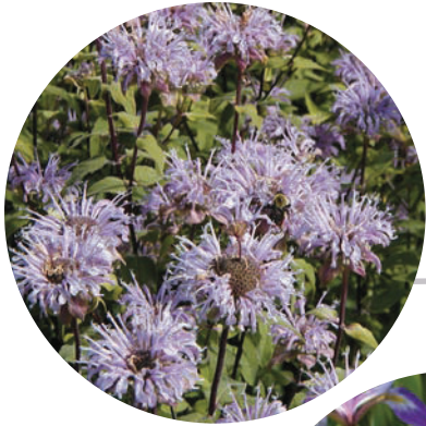
Bergamot ( Monarda fistulosa ) 4' H x 3' W Bloom Time: July-September