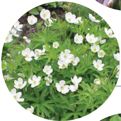
Canada Anemone ( Anemone canadensis ) 2' H x 2' W Bloom Time: May-June