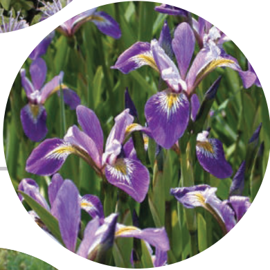
Flag Blue, Iris ( Iris versicolor ) 2' H Bloom Time: May-June